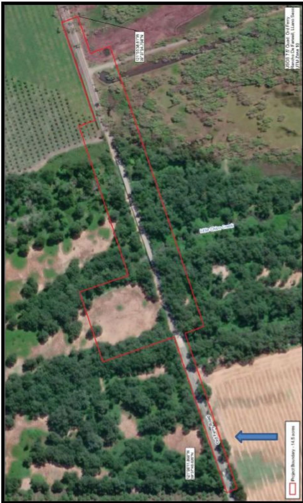
2) Proposed project location map